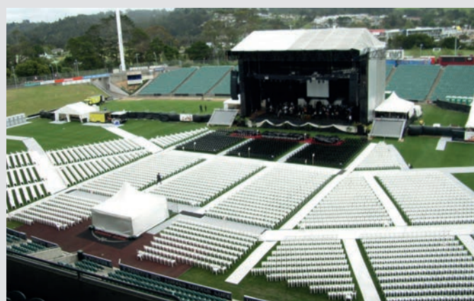
Pavarotti, North Harbour Stadium, Auckland, New Zealand