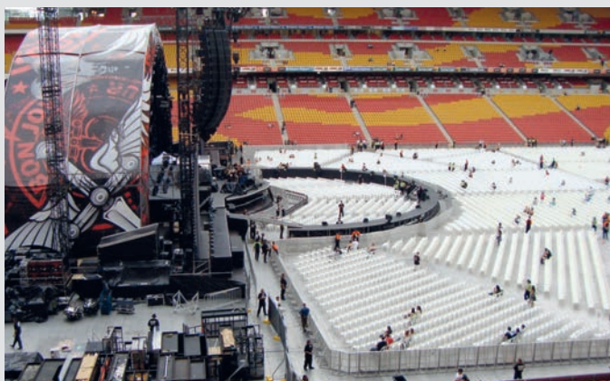
Bon Jovi, Suncorp Stadium, Brisbane