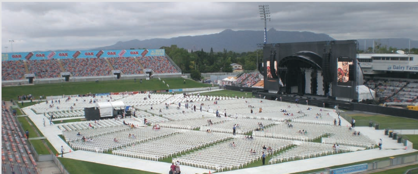
Elton John concert, Dairy Farmers Stadium, Townsville