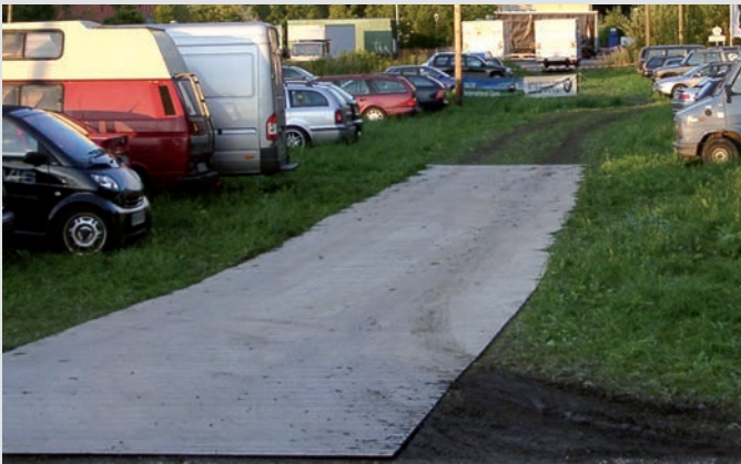
A temporary parking lot entrance built from LD panels