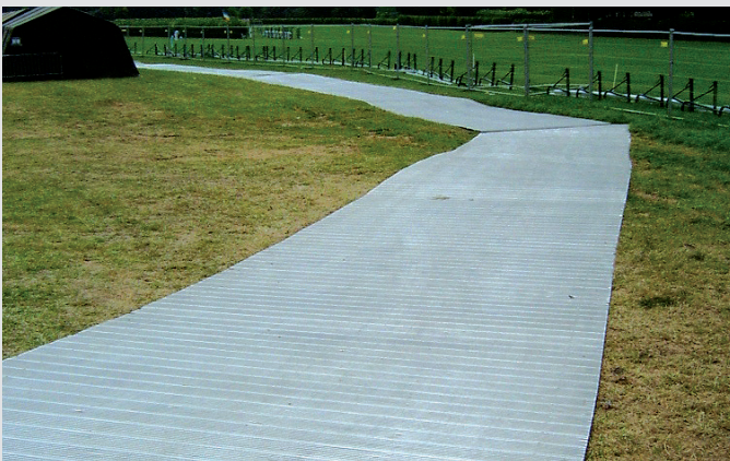
A temporary LD panel roadway