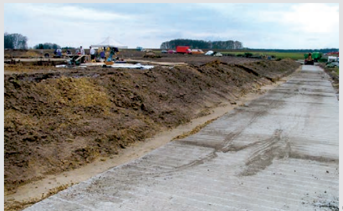
A construction site bypass road made of LD Panels