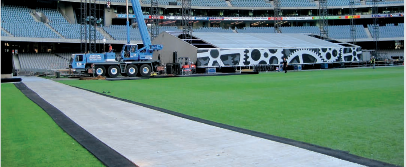
A LD panel transport road, AC/DC Black Ice World Tour, Melbourne, Australia